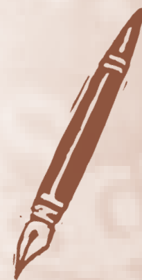
– Sue Novak

If each of us brings in just one new person, we can make a great difference in the shape of our communications future.